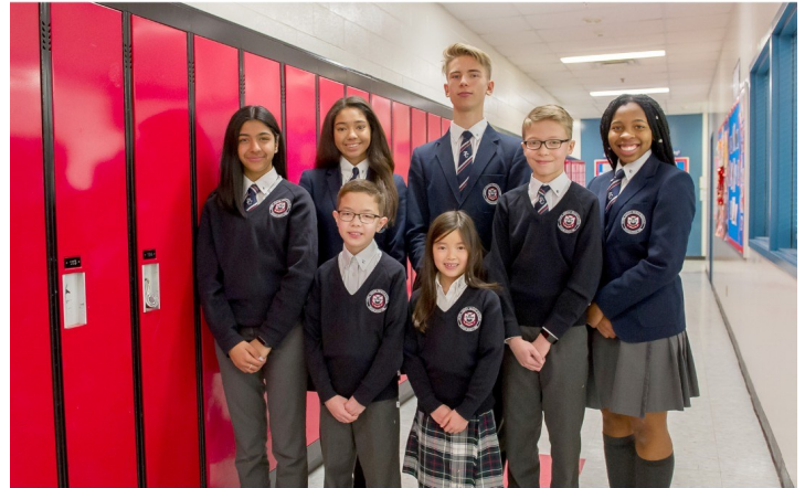
Best Private School ★ Best Montessori ★ Best Nursery School Best Daycare/Child Care ★ Best Summer Camps