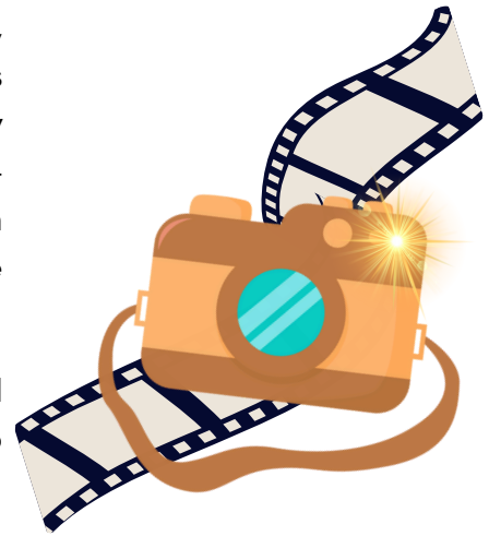
Photo proof packages will be distributed approximately 1 month later. Students who are unable to attend on photo day will have a retake day on October 9th, 2024.

Mark your calendars for our annual Photo Day on Wednesday, September 18th. On Photo day, our Amarillo Campus students will have both individual and group photos taken by our official photographers. We ask that afternoon only half-day students attend school in the morning to be included in their class photos and the yearbook. All Grade 1 students are required to wear their full school uniform.