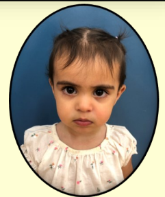
Photo proof packages will be sent out approximately 1 month later. Students who are unable to attend on photo day will have a retake day on Tuesday morning, January 17 th , 2023.

Part-time and afternoon only students are asked to attend school in the morning session so their picture may be included in the class photo and yearbook. All grade 1 students must be in their full school uniform.