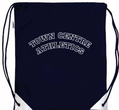
DRAWSTRING BAG 19.95