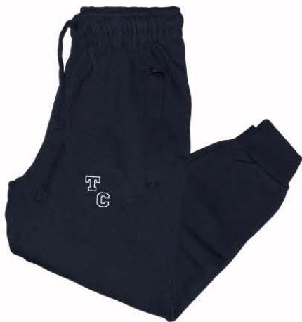
SLIM SWEATPANT 45.95 - 56.95