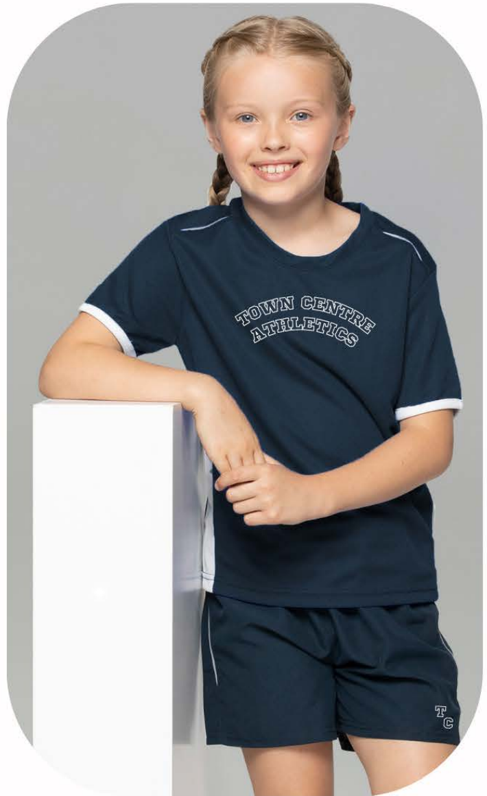
APTUS ESSENTIALS GYM SHIRT APTUS ESSENTIALS GYM SHORT 26.95 - 29.95