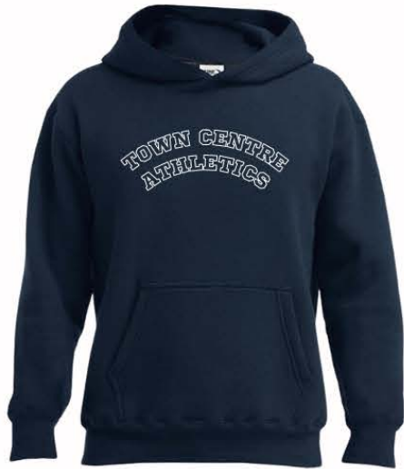
PULLOVER HOODIE 49.95 - 54.95