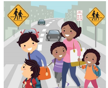
Photo Re-Take Day

With everyone's cooperation we can all stay safe!