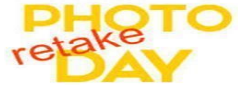
Photo Re-Take Day will take place on Friday, November 3 for any student who wishes to have their photo re-taken, and students who were absent on the first Photo Day. A parent memo recently went out on the school app asking interested parents to complete and return the form for photo retakes to the office.