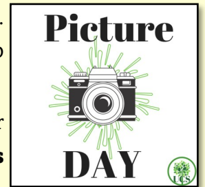
Photo proof packages will be sent out approximately 1 month later. Students who are unable to attend on photo day will have a retake day on Tuesday morning, January 16 th , 2024.

Afternoon only students are asked to attend school in the morning session so their picture may be included in the class photo and yearbook. All grade 1 students must be in their full school uniform.