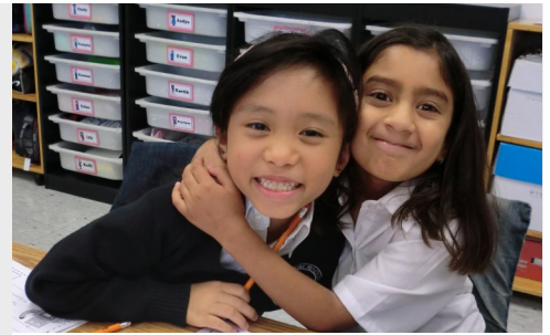
February is BLACK HISTORY MONTH

The PYP and MYP teachers have been incorporating the themes of diversity, international mindedness, and global applications in their units. The goal of IB is to “develop inquiring, knowledgeable and caring young people who help to create a better and more peaceful world through intercultural understanding and respect.” During the month of February, the LRC will promote Black History Month and students can check out books related to the topic. We also look forward to a special performance for the grades 2 and 3 students, by Tribal Vision, an aboriginal dance group, and a fun workshop in drumming by Living Rhythm for the grade 4 students.